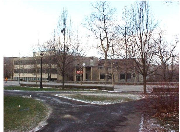
Eastern façade of existing Cornell Health Services Facility

The programming phase of the project is complete and design was started in April. The design team is currently working on the development of three options for evaluation. The current plan is to decide on an option in July and then develop that option through Schematic Design.