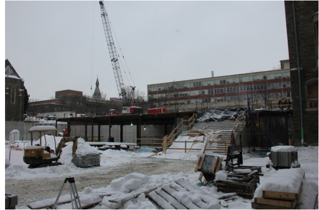
View north into the Classroom Addition's structure